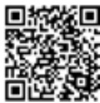
Internet Safety Parent Resource Page

See also: Board of Education Policies on Computer Network & Internet Acceptable Use for Students & Staff, 4526 , and District Sponsored Internet Publishing, 5221 .