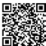
Board of Ed Mtgs

Public Board of Education meetings are scheduled regularly and appear by month in this calendar. Additional meetings may be called at any time. Date, time, and place of meetings are announced on the school district Web site ( www.greatneck.k12.ny.us ), in the local press, and can be viewed in the incorporated villages of Great Neck on Cablevision Channel 75 and Verizon Channel 32. Board meeting agendas are also available on the district Web site or may be received by e-mail by calling the Board's secretary at 441-4001.