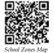
School Zones Map